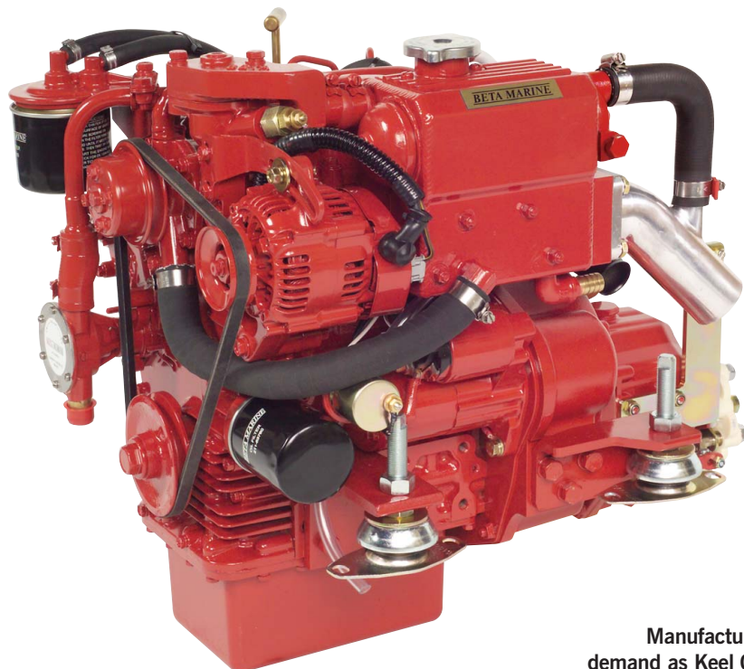
Manufactured on demand as Keel Cooled

2 Cylinders - 599cc - 16bhp max at 3,600 rev/min - 98Kg